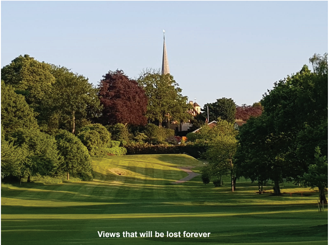
Views that will be lost forever