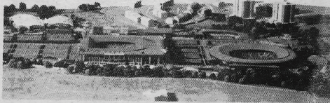
How the new Wimbledon will look, with the golf course in the foreground.